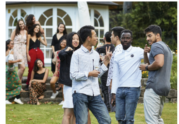
Closing Ceremony in Frankfurt

Especially these extra curricular events create bonds between fellow students - embedding you in a vivid and inspiring international community of interconnected people.